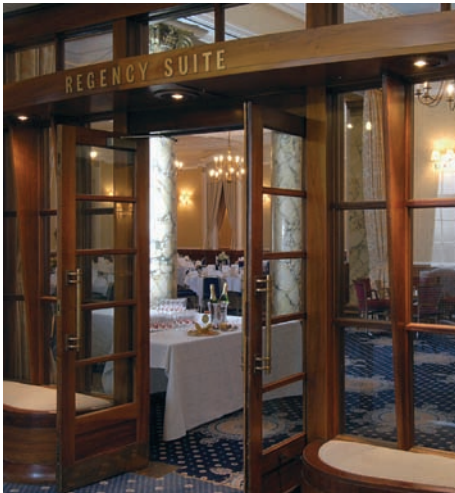
THE REGENCY SUITE FOYER