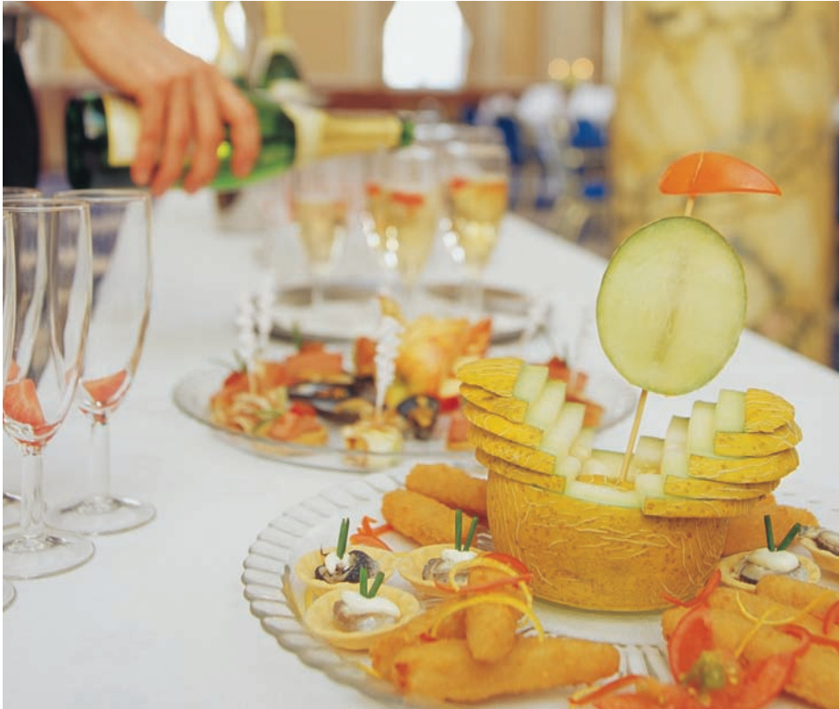
THE REGENCY SUITE RECEPTION