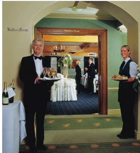
THE WALLACE SUITE RECEPTION