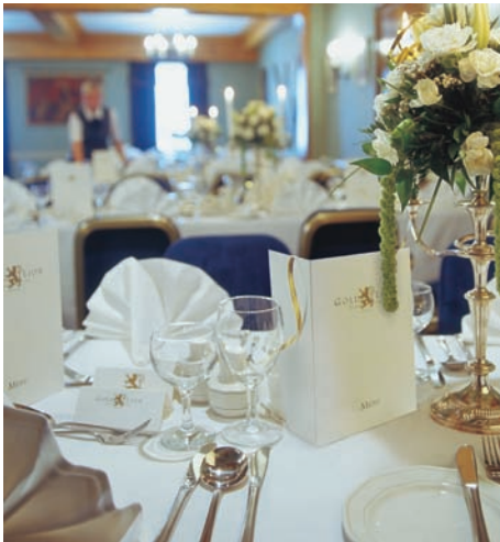
THE WALLACE SUITE

Our OAK ROOM offers unique surroundings for your ceremony. Its character is one of grace, tradition and calm. It offers the dignity of a church and yet your reception in the WALLACE ROOM , only foot steps away, is ideal for more intimate celebrations; offering a traditional atmosphere for parties that include from twenty to sixty guests.