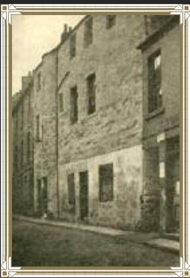
OLD GIBB'S INN